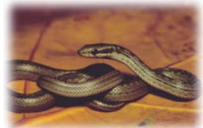
The Anguillan Racer Snake is unique to Anguilla and important to global biodiversity.

It is a little-known fact that many of the United Kingdom's most significant biodiversity resources are not in the British Isles themselves. They are to be found in the UK Overseas Territories (UKOTs), former colonies and territories scattered around the world. Anguilla has been British since 1620. Its land area is relatively small, but its contribution to world biodiversity is great. Its salt ponds provide important habitat for endangered bird species such as the roseate tern. Endemic species – those which occur in only one place in the world – are critically important to the planet's overall biodiversity. Despite its small size, Anguilla boasts at least three endemic reptiles. Under international treaties, it is the joint responsibility of the UK Government and the Government of Anguilla to care for this precious biodiversity.