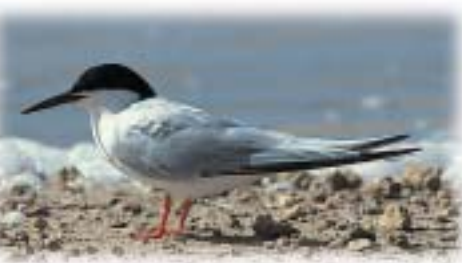
Endangered seabirds such as the Roseate Tern rely on Anguilla's salt ponds as critical habitat.

· Projects involving several UKOTs (planning for climate change in the Caribbean) Full details of the Guidance Notes, application forms and complete listing of projects approved to date may be found on the website of the UK Overseas Territories Conservation Forum at www.ukotcf.org . Click on 'OTEP'.