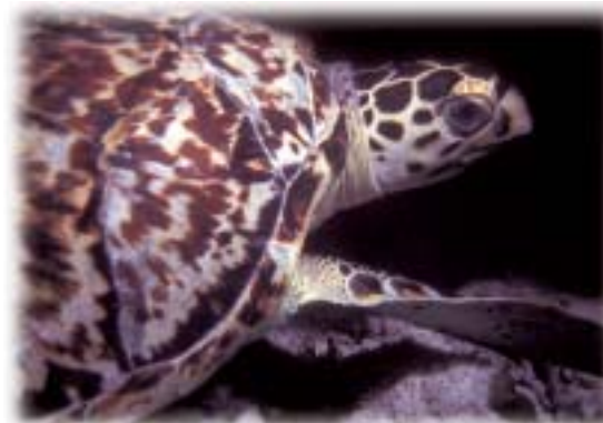
Anguilla's beaches, reefs and seagrass beds are important to the world's sea turtles.

September 2001 (see centre pages of this brochure). The Charter includes guiding principles and a set of mutual commitments by the UK Government and the Government of Anguilla in respect of integrating environmental conservation into all sectors of policy planning and implementation. Anguilla's first commitment is to develop a detailed strategy for action to implement the principles of the Charter, and the first commitment of the UK Government is to help build capacity to support integrated environmental management. The Overseas Territories Environment Programme (see back page) is a key tool in meeting this commitment.