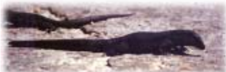
Anguilla's black lizard exists nowhere in the world except Sombbrero Island.