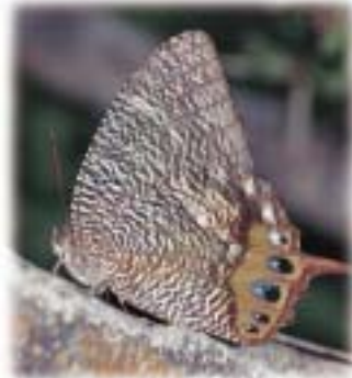
The Turks Island Leafwing is named for its cryptic underwing.

Full details of the Guidance Notes, application forms and a complete listing of projects approved to date may be found on the website of the UK Overseas Territories Conservation Forum at www.ukotcf.org . Click on 'OTEP'.