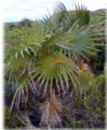
The Silvertop Palmetto -- a globally rare tree which is abundant in the TCI -- is sustainably harvested for use in traditional crafts.