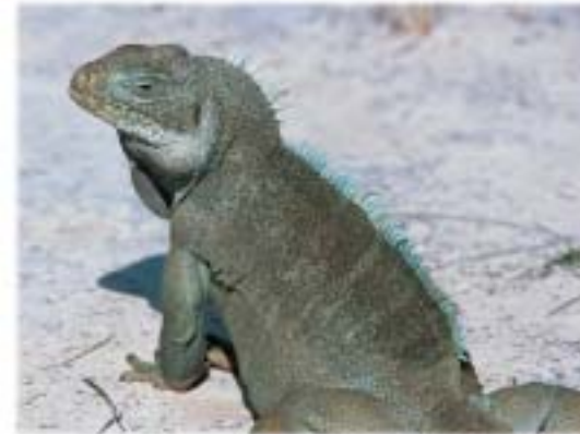
The TCI Government and National Trust are carrying out conservation programmes for the TCI's endemic Rock Iguana.

guiding principles and a set of mutual commitments between the UK Government and the Turks and Caicos Government in respect of integrating environmental conservation into all sectors of policy planning and implementation. The TCI's first commitment was to develop a detailed strategy for action to implement the principles of the Charter, and the first commitment of the UK Government is to help build capacity to support integrated environmental management. The TCI has led the way: Chief Minister Michael Misick's government was the first UKOT to adopt a full Strategy for Action.