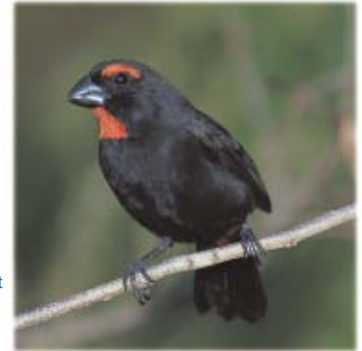
The TCI boasts an endemic sub-species of the Greater Antillean Bullfinch which is limited to Middle and East Caicos.

It is a little-known fact that many of the United Kingdom's most significant biodiversity resources are not in the British Isles themselves. They are to be found in the UK Overseas Territories (UKOTs) former colonies and territories scattered around the world. The Turks and Caicos Islands are one of the less populous of the UKOTs, but they support pristine wetlands and woodlands of incalculable environmental value. Endemic species – those which occur in only one place in the world – are critically important to the planet's overall biodiversity. The UKOTs have at least ten times as many endemic species as Britain itself, and the TCI boasts, among other endemics, at least six unique reptiles. Under international treaties, it is the joint responsibility of the UK Government and the Government of the Turks and Caicos to care for this precious biodiversity.