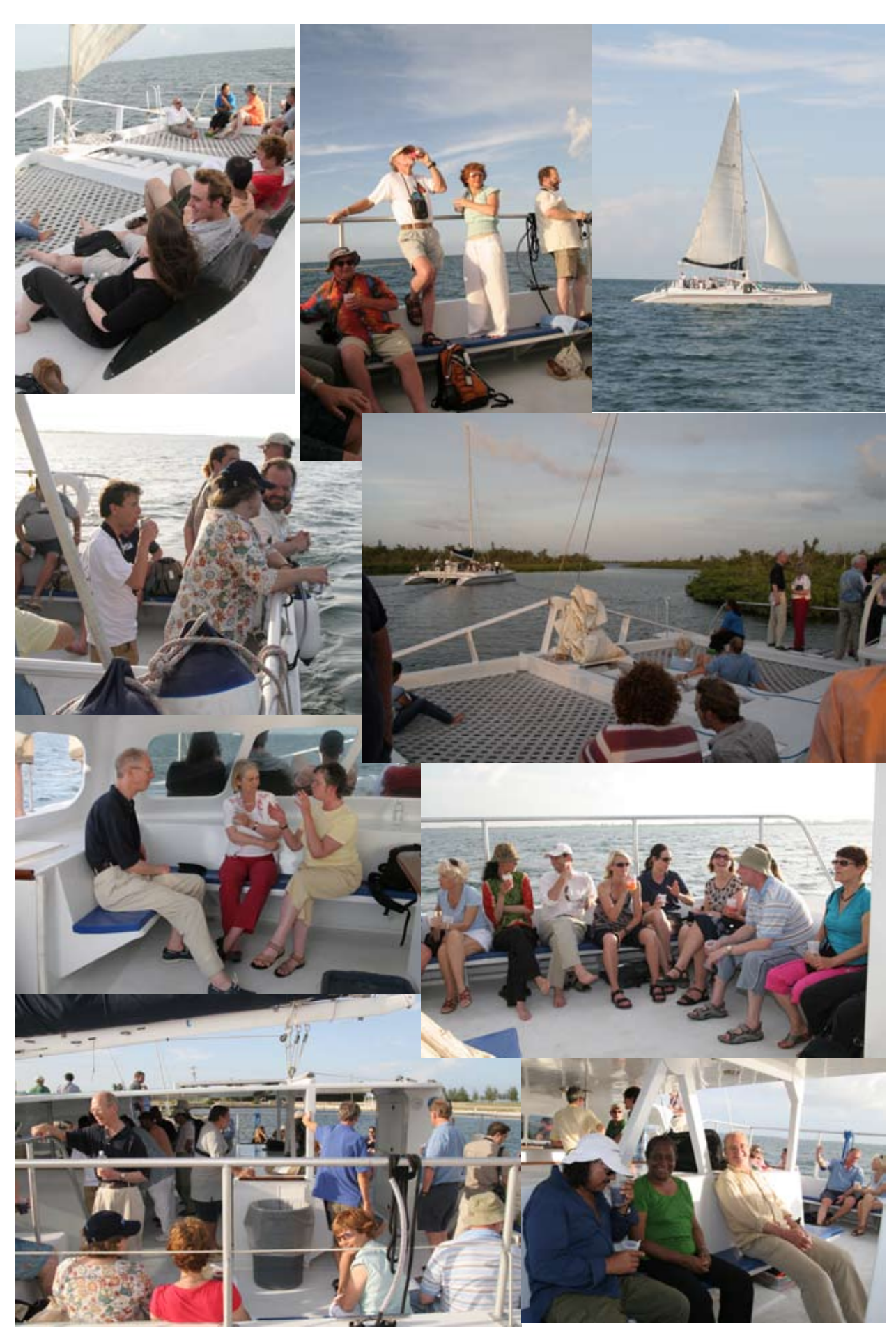
Marine ecosystems tour in North Sound and its mangrove areas, and pre-conference dinner informal discussions