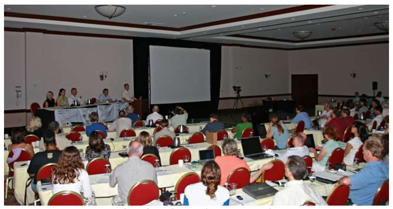
The conference listens to the Minister's speech.