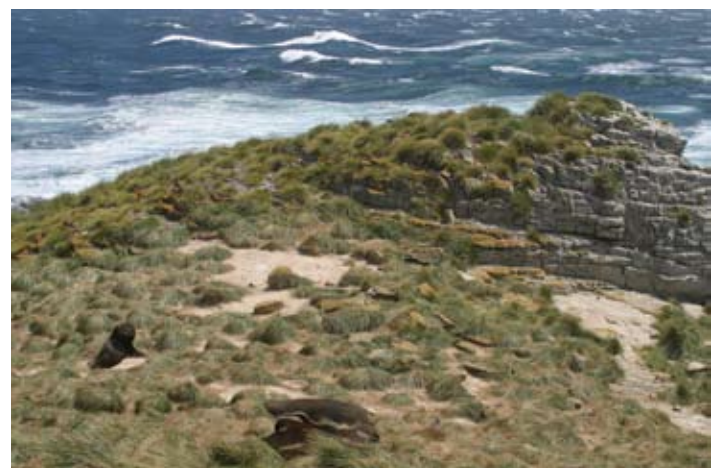
Tussac grass ecosystem, with Fur Seals Arctocephalus australis, Falkland Islands.

In addition to work under the SAIS project, a range of activities have continued in the Falklands to protect native biodiversity and counter the threat posed by invasive species. The on-going project work, part-funded by OTEP, towards the conservation of the endemic Cobb's wren Troglodytes cobbi made further progress during the year. In August 2009, plans to clear Tea Island (in the Beaver group) of rats went ahead as scheduled, despite some difficult weather conditions. Bait was spread around the island by hand-broadcasting, although not on the slopes of Tea Mountain or the dense tussac grass Parodiochloa fabellata at Tea Point. The project leaders are optimistic that Tea Island will become the largest island in the Falklands, and one of the largest in the world, to be cleared of rats using this method, although it will be some time before this is known. The next step in restoring Tea Island habitats will involve the planting of tussac grass in key areas. With assistance from the Falkland Islands Government's Environmental Studies budget, several students stayed on after the rat baiting to revive the traditional practice of winter contract tussac planting.