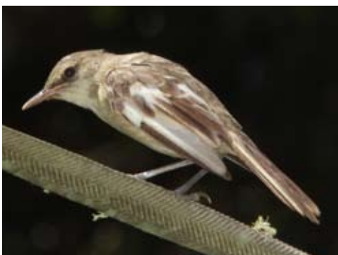
Pitcairn Reed-Warbler Acrocephalus vaughani (left) and the closely related Henderson Reed-Warbler A. taiti are two of the six endemic birds of the Pitcairn group. They are found throughout their respective islands, including the excellent Eco-trail on Pitcairn (right).