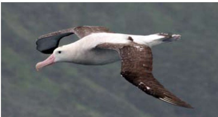
Tristan Wandering Albatross Diomedea dabbenana in front of Gough Island, Tristan da Cunha, where (apart from a few pairs on Inaccessible, also in the Tristan group) all of this species breed. The survival of this species and several others is at severe risk from predation of chicks by introduced mice.

Discussions during the Cayman conference and in other contexts have again highlighted a number of issues which are of broad concern to conservation workers across many UKOTs/CDs. Inevitably, climate change and invasive species are major