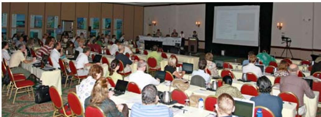
Cayman Conference in session.