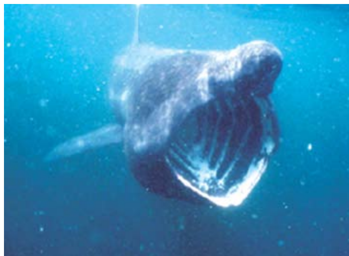
Basking Shark Cetorhinus maximus.

The Isle of Man Government continues to progress the Marine Nature Reserve project to designate a site by 2011. Recent organisational changes have meant that this is being led by the Fisheries Division where the marine biodiversity officers are now based. The Department of the Environment, Food and Agriculture