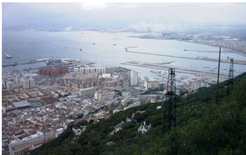
Part of Gibraltar Bay from the Rock. Below in the view are the town, with the airport to the right and Spain beyond. Despite the level of usage, the Bay remains a very important nature site, including for dolphins (below).

Jersey's South East Coast Wetland of International Importance has been listed by Wetlands International as their "Threatened Wetland of the Month" because of the likely impact of a municipal waste incinerator ( Forum News 34, p.11). This is to be built on reclaimed land adjacent to this first site in the Channel Islands designated under the Ramsar Convention. Although this will be the largest civil engineering project on the Island to date and should vastly improve local air quality, it will be built on a toxic landfill site that leaches material into the marine reserve with every high tide. The development will not remediate this long-term threat to the marine reserve, raising questions over the competence of the