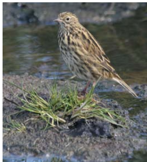
South Georgia Pipit Anthus antarcticus is one of the species threatened by introduced invasive rats, the risk being increased as glaciers retreat and allow access by rats to previous rat-free areas. The proposed rat eradication is thus vitally important.

South Georgia is notable for having no resident population. There is no air access, and it is expensive to charter and run a ship from the Falklands. Consequently, the costs of carrying out conservation work on South Georgia are much higher than on less remote islands. Nonetheless, important work has been undertaken in the Territory during the year, including under the SAIS project. Activities have included steps towards the eradication of wavy bittercress Cardamine flexuosa , a pernicious invasive weed, and plans are also being made for rat eradication. The South Georgia Heritage Trust are investigating logistics and formalising their relationship with the SGSSI Government, potential funders and other stakeholders. A draft report relating to reindeer eradication will be published on the SGSSI Government website www.sgisland.gs before a final