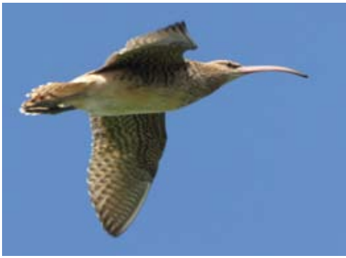
Left: Bristle-thighed Curlew Numenius tahitiensis at Henderson. Breeding in Alaska and wintering in the Pacific islands, this species makes some of the world's longest continuous migratory flights. Oeno supports globally important numbers. Both Oeno and Ducie (pictured right) atolls support globally important colonies of breeding seabirds, being the most important sites for some species.