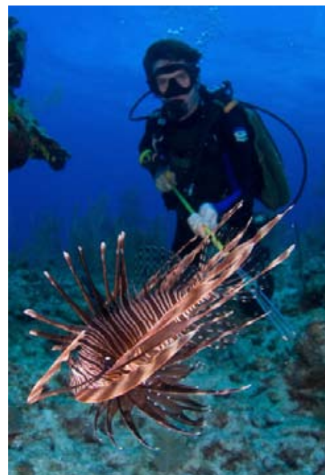
Pacific red lionfish Pterois volitans.

Caribbean waters over the last year emphasised that, as well as having profound local impacts, species invasions could afflict an entire region. The recent global economic downturn hit some UKOTs very hard, placing even greater strain on conservation bodies reliant on public funding for all or part of their work, and making it more difficult than ever to keep environmental issues on the local political agenda. Nonetheless, the year produced further evidence that local communities were prepared to fight for environmental protection, particularly in the face of inadequate planning processes and unsustainable development, which remained a major concern in Caribbean UKOTs. Reports of severe coral bleaching around Grand