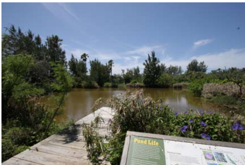
Restored wetland and interpretative sign at Somerset Long Bay Pond, Bermuda. Adjacent parts of the site were already designated as a Wetland of International Importance under the Ramsar Convention. This restoration, extending the protected site, is one of the areas bought by public contributions to the Buy Back Bermuda campaign, operated by Bermuda National Trust and the Bermuda Audubon Society. Despite the huge sums contributed by Bermuda sources to safeguard this site, for which UK is jointly responsible under international agreements, UK Government felt unable to contribute to the costs of management planning. UKOTCF is working with Bermuda partners to assist in this respect.

During the year, significant and welcome progress was reported on a suite of new environmental legislation in Anguilla, with the passing of the Biodiversity & Heritage Conservation, CITES and National Trust Acts. Other relevant legislation remained in development, along with new policy instruments in areas such as energy. Amongst specific projects for conservation locally, the Anguilla National Trust and the Department of Environment have been working with partners from RBG Kew and Fauna & Flora International towards a major initiative focused on the restoration of Dog Island. Species-level work has included the