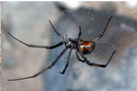
Prosperous Bay Plain, St Helena - the site of the proposed airport - is immensely important for invertebrates, many of which are endemic. St Helena has over 100 species of spiders, of which at least 45 species and 12 genera are endemic. At night, many spiders, such as these, emerge on

the Plain. Note that the one on the left is carrying a brood of young.