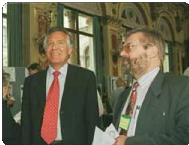
UK Foreign & Commonwealth Minister of State Peter Hain (above left) admires some of the Forum's new display boards (left) on the wealth of biodiversity in UK Overseas Territories, at the 'String of Pearls' Open Day at the FCO

The Forum is working with the Gibraltar Ornithological & Natural History Society to organise the conference "Calpe 2000: Linking the Fragments of Paradise", sponsored by the Government of Gibraltar. The conference will take place from 28 th September to 1 st October 2000.