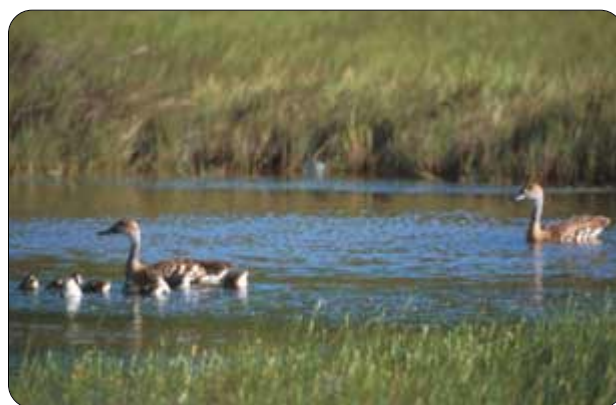
West Indian whistling ducklings feed around their mother while the drake stands guard, Middle Caicos 1999. Local people reported the breeding of this vulnerable species in the area of our Darwin Initiative project following the planning meetings with their involvement

A useful meeting on CITES implementation was also held in London