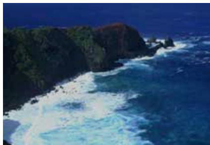
A view towards St Pauls across Rope Bay, Pitcairn

minds, both on the Island and elsewhere, it remains uncertain exactly what service is envisaged (e.g. emergency only, a sporadic charter service, a scheduled service). Until this issue is resolved, the exact extent of - and the regulatory framework for - the airstrip remain unknown. When they are known, it will be easier to draw up terms of reference for the Environmental Impact Assessment (EIA) that should precede work on the airstrip.