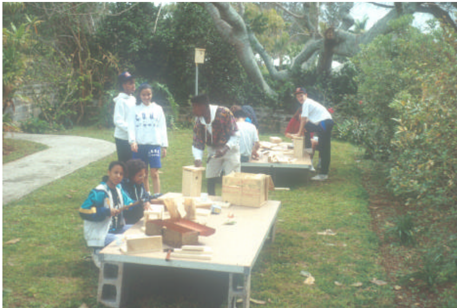
Conservation and education: bluebird nestbox construction by students at a school in Bermuda