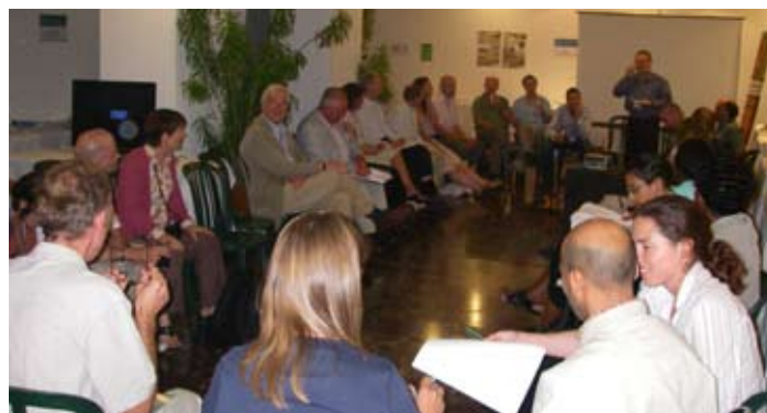
UKOTCF informal meeting at the Réunion conference.

The activities of the Forum's Southern Oceans, Europe Territories,