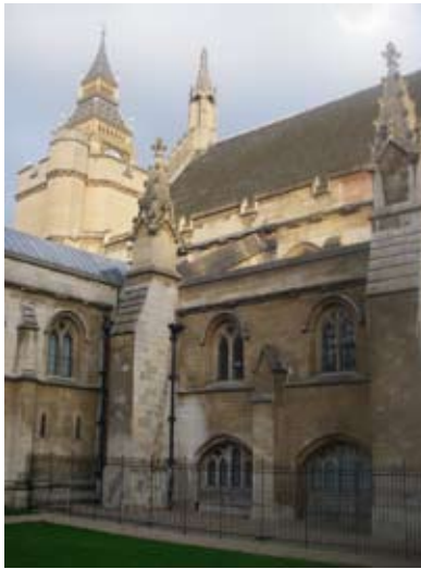
Westminster Hall, UK Parliament (venue of the reception for UKOTCF - see also page 4), with the tower of Big Ben behind. Inputs into Parliamentary discussions have been a major, successful feature of recent UKOTCF work.

A great deal of time during the year was spent planning and making preparations for the UKOTCF-organised conference on conservation in UKOTs, CDs and other small island communities, to be held in Grand Cayman, 30 May – 5 June 2009. This is the fifth in a series of conferences, following those held in London (1999), Gibraltar (2000), Bermuda (2003) and Jersey (2006). The wide-ranging consultation undertaken during the year with Member and Associate