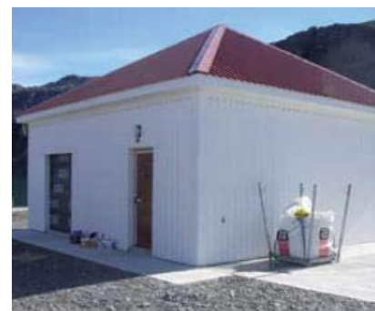
New quarantine building, South Georgia (see also page 10).

consultations and internal activities, through regular e-mail circulations. In addition, in August 2008, the Forum again used the British Bird Watching Fair, an event that attracts 15-20,000 visitors annually, as a platform for raising awareness of the UKOTs and the important biodiversity that they support.