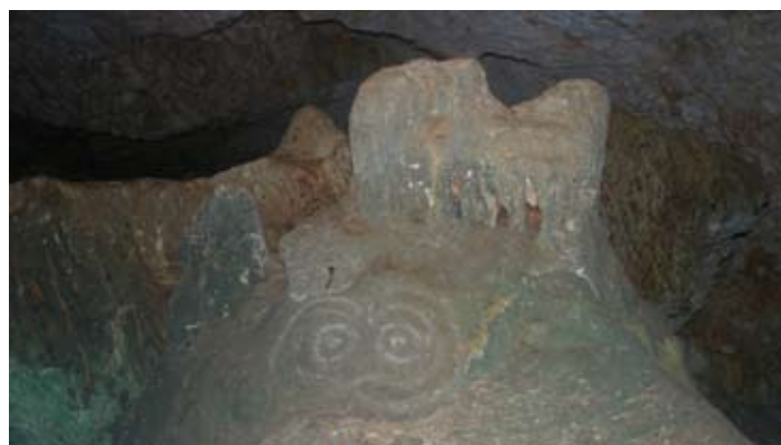
Carvings by indigenous, Arawak people in Fountains Cave, Anguilla, one of the sites on the UK tentative list for World Heritage status.

At a European level, UKOTCF contributed during the year to consultations on Future Relations Between the EU and the