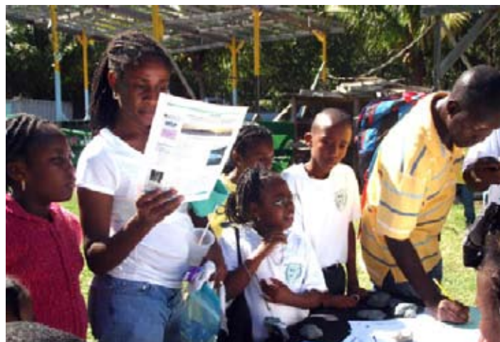
JVDPS's Community-based Programme Advancing Environmental Protection and Sustainable Development is successfully involving local parents, students and teachers, here using the project newsletter to find answers to a limericks quiz.

Also in BVI, the Jost van Dyke Preservation Society (JVDPS) began work under its OTEP project, implementing a range of community-based activities, such as environmental research, monitoring, education, and development of resources including an information centre.