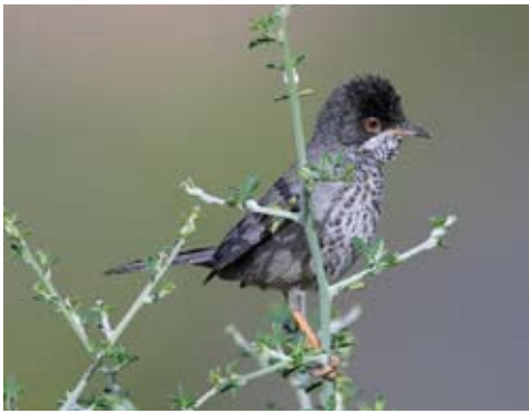
Cyprus SBAs: the Good (left), Cyprus Warbler, endemic to the island; the Bad and the Ugly (right), illegal, permanent mist-net stands for catching migrant birds in the Eastern SBA. These illegal activities could at least be impeded if these permanent fixings were removed frequently.