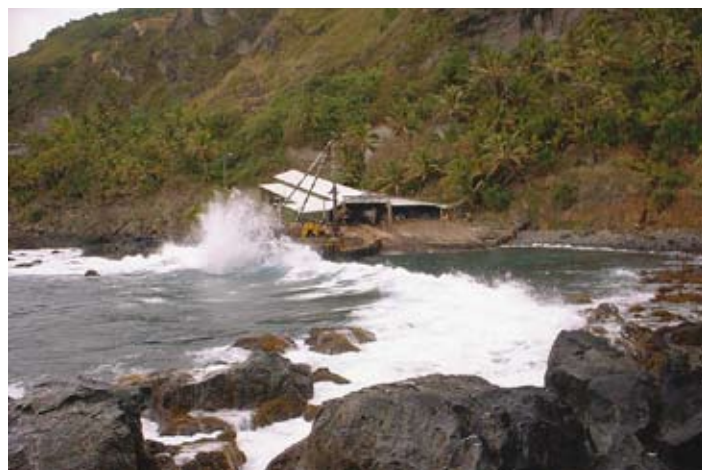
The main landing point at Bounty Bay, Pitcairn.