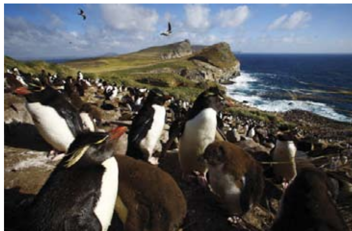
Rockhopper penguins in the Falkland Islands, the subject of a new study by New Island Conservation Trust (see page 10).

The review of actual and potential Ramsar Convention Wetlands of International Importance in the UKOTs/CDs carried out